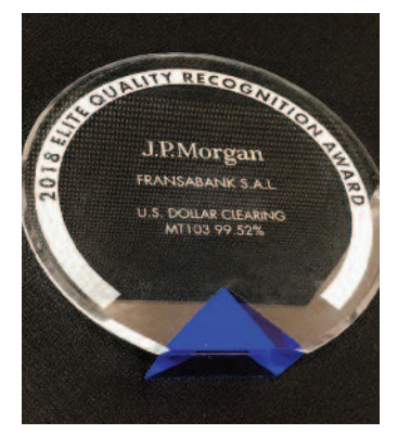
JP Morgan Award

The award further illustrates the Bank's leading presence in the global financial services market.