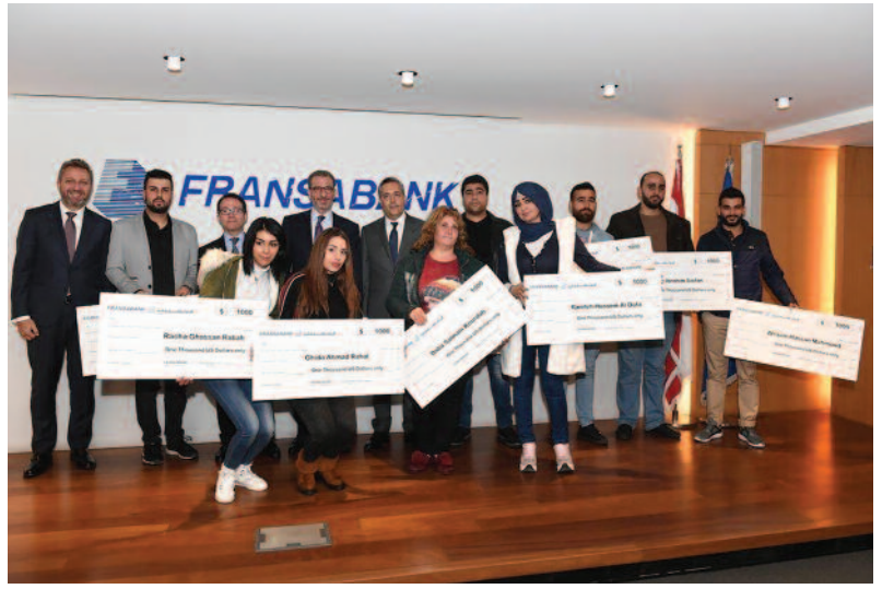
The ten winners in the donation ceremony

As for Fransabank's financial inclusion initiatives, by the end of December 2017, around 21,000 micro loans were recorded worth $ 41 million, 43% of the beneficiaries of these loans ranged between 18 and 35 years old, while the percentage of women beneficiaries was 41%. In 2018, and specifically in this initiative, Fransabank distributed 10 grants to five men and five women between the ages of 20 and 27.