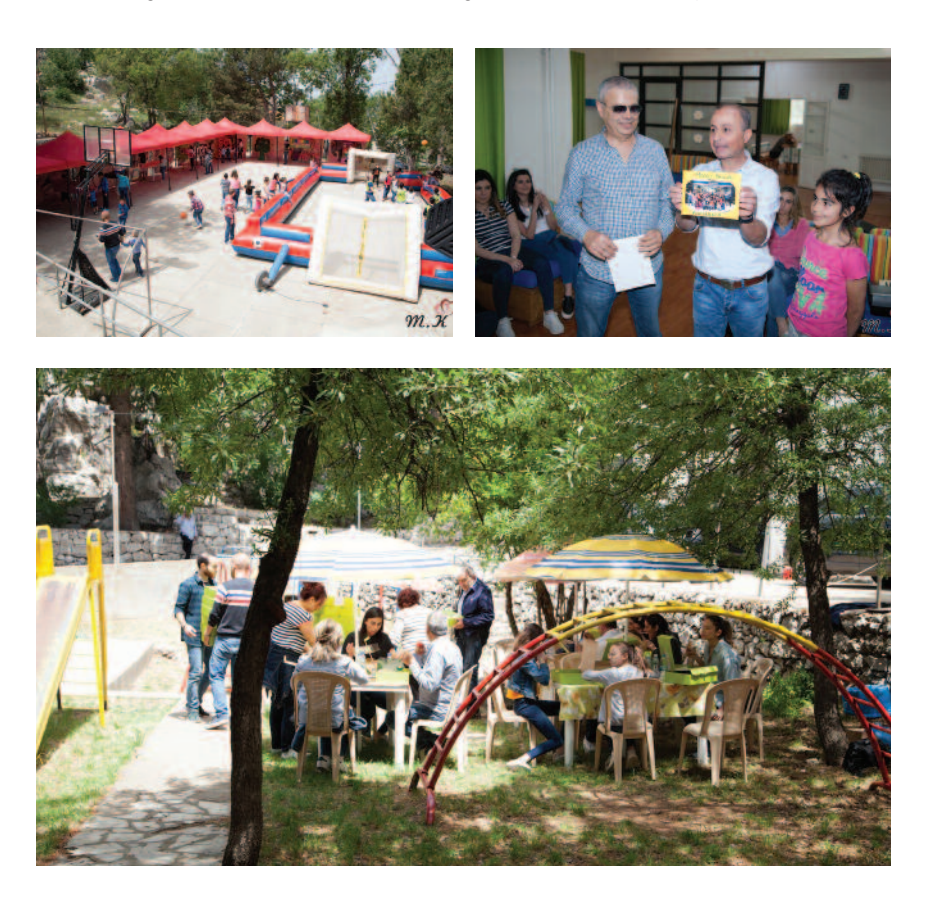
*a local NGO that works on enhancing the daily lives of people in need and giving generations the means to become autonomous and responsible adults through a holistic approach which incorporates the family in the child's rehabilitation process.

Fransabank is keen to contribute to such NGOs aiming at equipping generations with the right tools to have a safe reintegration into the society.