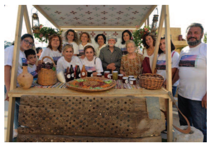
One of the stands of the competing villages

Aiming at highlighting the charming rural areas of Lebanon, and promoting rural tourism, Fransabank partnered with the Ministry of Tourism in Lebanon and L'Orient le Jour (OLJ) newspaper, to launch a corporate social responsibility initiative, focusing primarily on encouraging tourists, expatriates and residents to go outside the city and discover the natural, cultural, religious, archaeological and gastronomic sides of Lebanon.